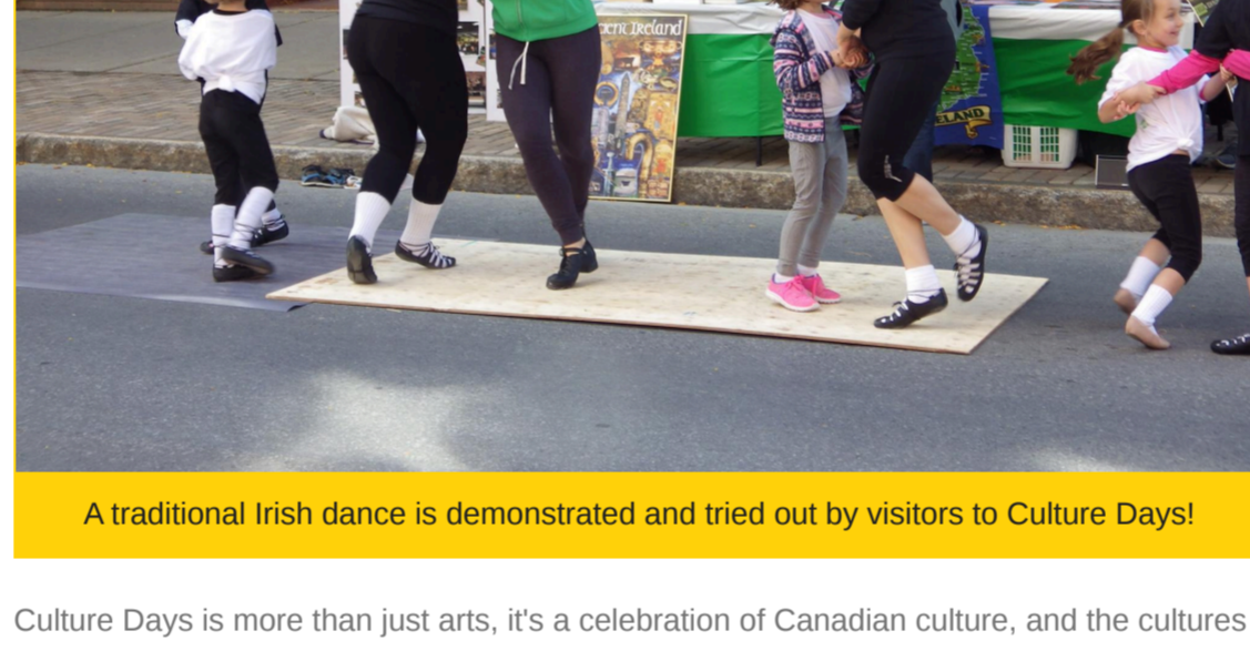
A traditional Irish dance is demonstrated and tried out by visitors to Culture Days!

Artists of all descriptions, dancers, musicians, artisans, heritage and community organizations fill King West Village in Brockville's premier community street festival celebrating arts, culture and heritage. Something for everyone and everyone welcome. This is a free event, and the Partnership will have a table there!