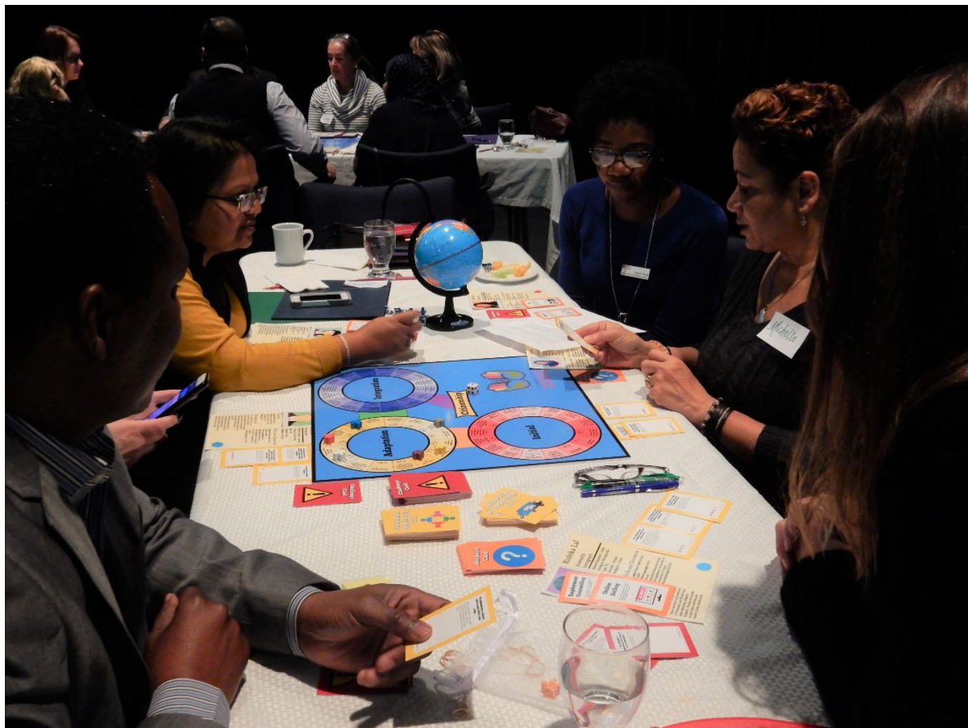
Some of our participants playing the Immigrant Settlement Journey Board Game.

Lastly, a board game centred around the immigrant settlement journey was played that enabled event participants to experience the journey as international students, refugees, skilled workers, and family sponsored individuals would. The game is now available to be borrowed from the St. Lawrence-Rideau Immigration Partnership. There are 12 boards, and each can have up to 8 players. It was a great day, and we want to give a huge thank you to everyone who was able to attend!